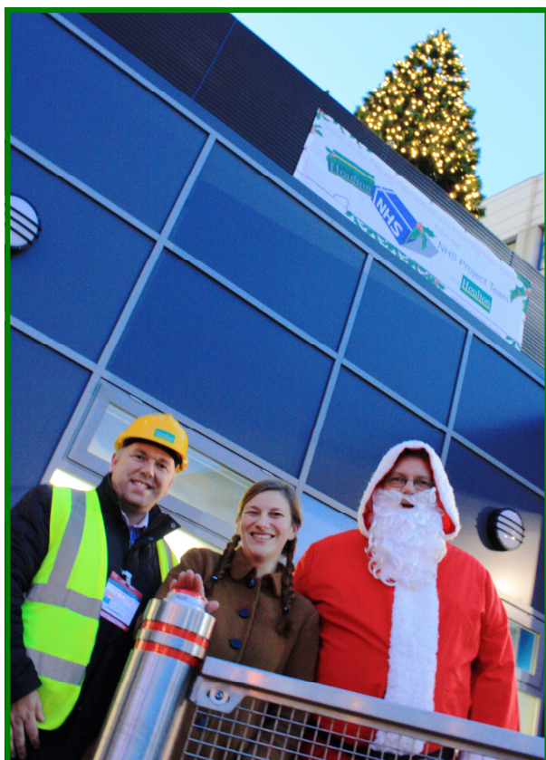
Christmas Tree at Children's Emergency Department Hull Royal Infirmary

The Directors and Staff are proud to report our achievements through 2013 in relation to People, Marketplace, Communities and the Environment, as well as our targets for the future.