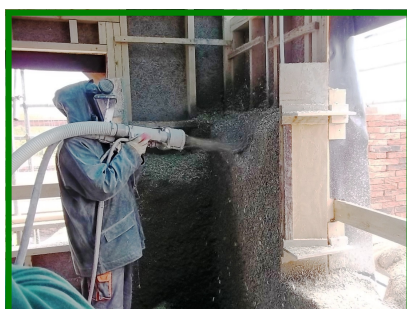
Sprayed Hempcrete Insulation