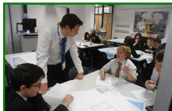
Maths in Construction Workshop