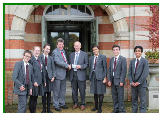
Leadership for Life Award Scheme 2013 Main Sponsor