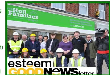
Hull Families Project