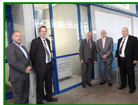
HRI 50th Anniversary