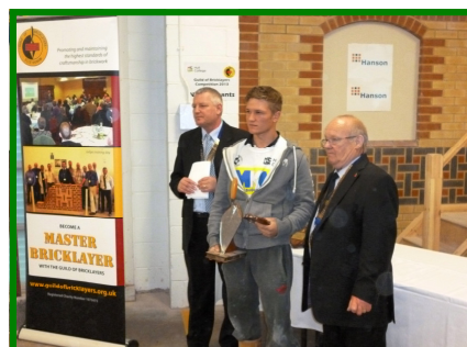
Yorkshire Bricklayer of the Year