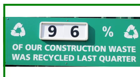
Yard Waste Re-cycling Results