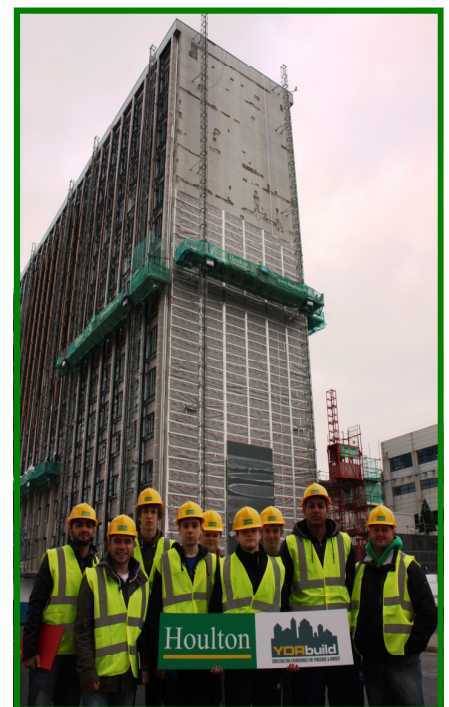
Houlton Open Sites Programme