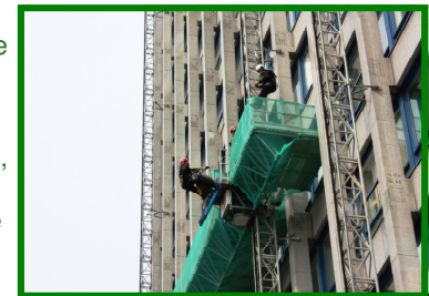
HRI Firefighter Training Exercise