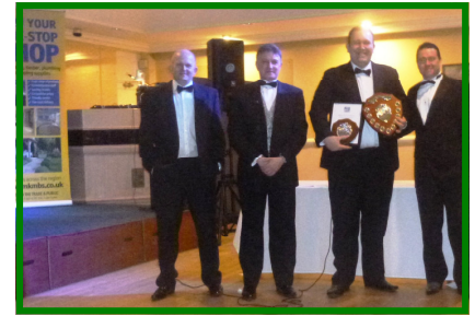
HBSG Best Site Safety Award