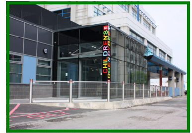
HRI—Donated Entrance Foyer