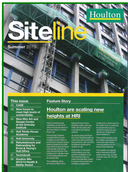
Houlton Sitrine Summer 2013