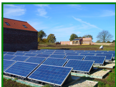
Photo Voltaic Ground Panel Array