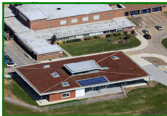
Holderness Vocational Centre

● Houlton Open Sites programme in conjunction with our client Hull and East Yorkshire Hospitals NHS Trust welcomed 16 students from Hull Construction College to the Tower Block project at Hull Royal Infirmary for their Health and Safety Workshops.