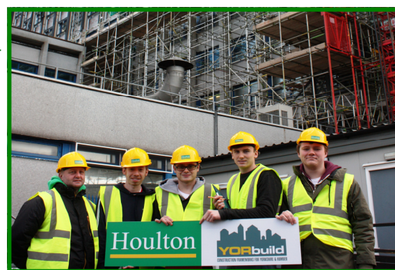
Houlton Open Sites Programme