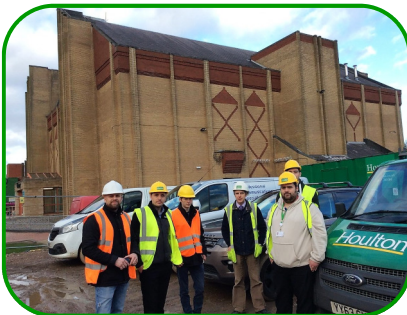
Student site visit at Scunthorpe