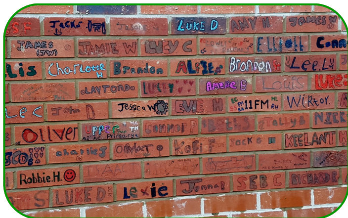
Brick Signing by Pupils of Riverhead Special School, Goole