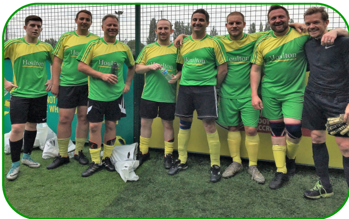
Houlton Football Team