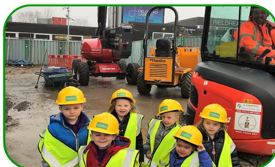
Pupils from Fieldhead Carr Primary School visit site