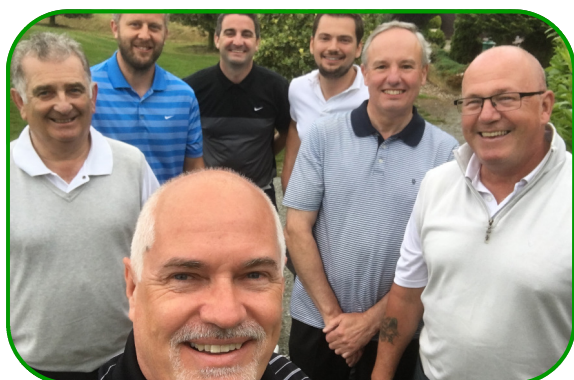
Houlton staff golf meeting