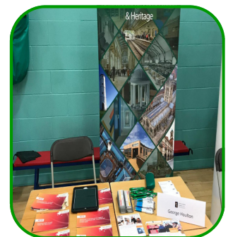
Winifred Holtby Career Fair