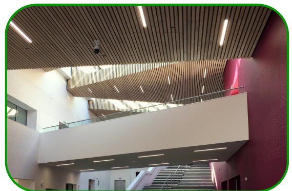
Sheffield Hallam University winning photograph