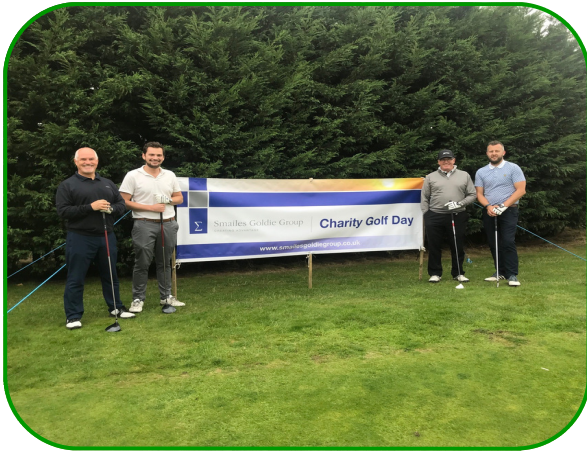
Houlton team at Smailes Goldie Charity Golf Day