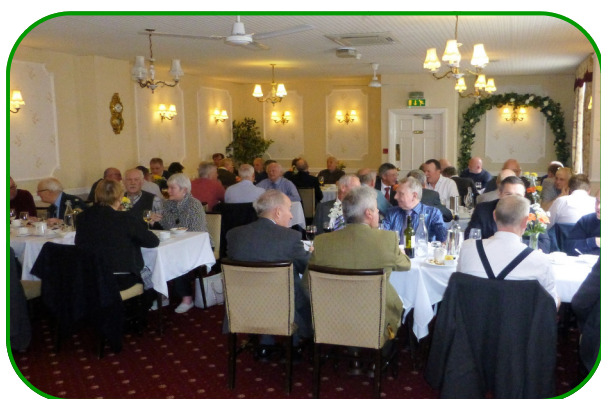
Annual pensioners and long serving employees luncheon