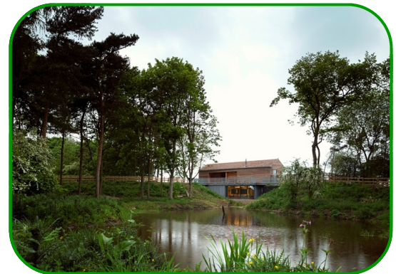
'The Hide' Tophill Low