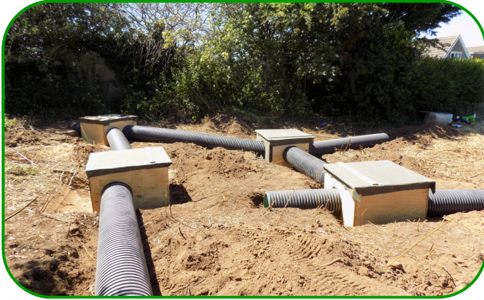
Construction of new badger setts