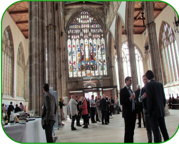
Houlton Hull Minster Event