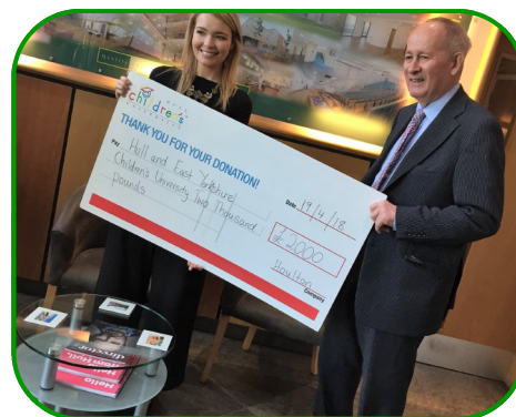
The Hull Children's University cheque presentation