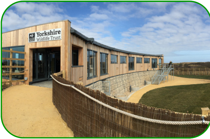
Spurn Point Visitor Centre