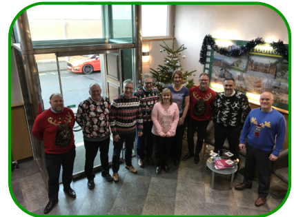
Office Christmas Jumper Charity Day