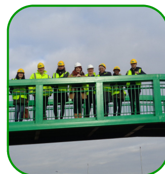
Brownlee Triathlon Centre