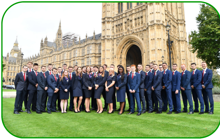
Team UK ready for WorldSkills, Abu Dhabi 2017