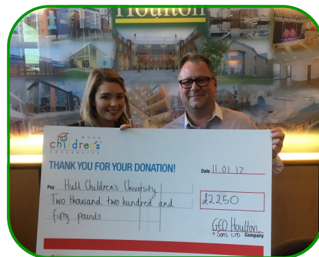
The Hull Children's University cheque presentation