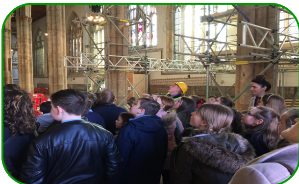
Griffin Primary School at Hull Minster