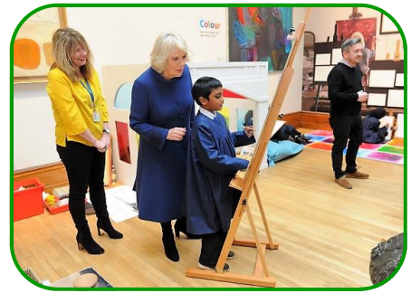
The Duchess of Cornwall at Ferens Art Gallery