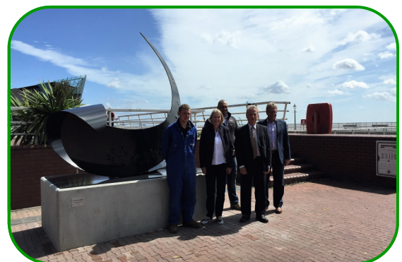
Cormorant Boat Sculpture