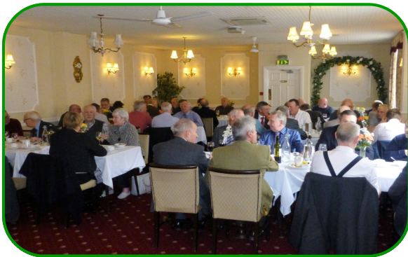
Annual pensioners and long serving employees luncheon