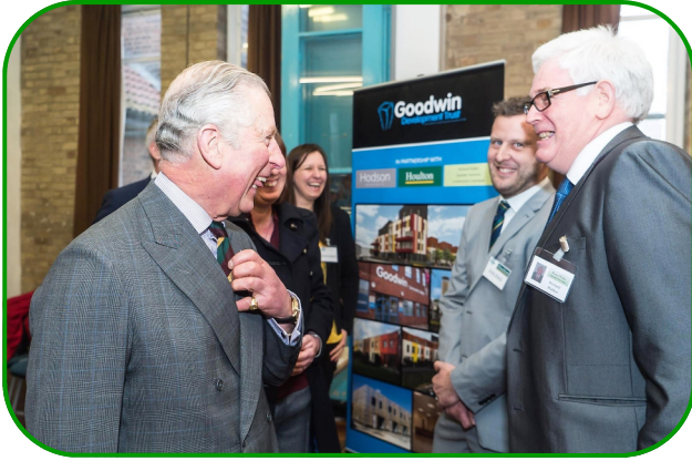
HRH the Prince of Wales visiting the Goodwin Trust