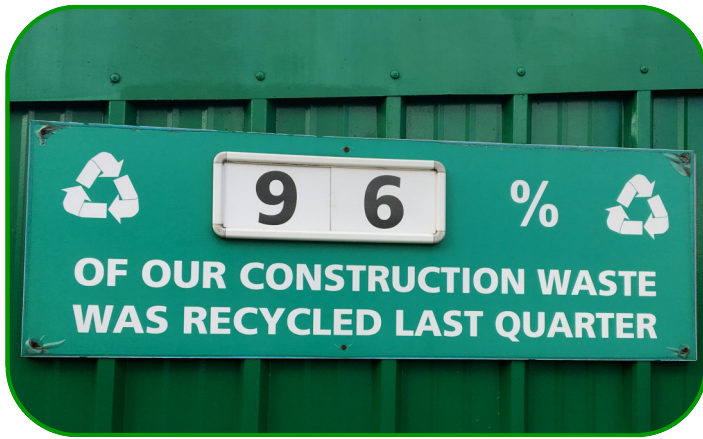
Houlton Yard Re-cycling Facility