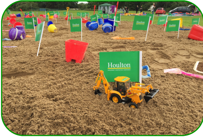
Supporting the Beach Family Day