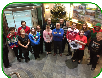
Office Christmas Jumper Charity Day