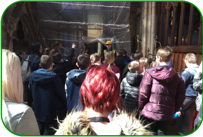
Griffin Primary School at Hull Minster