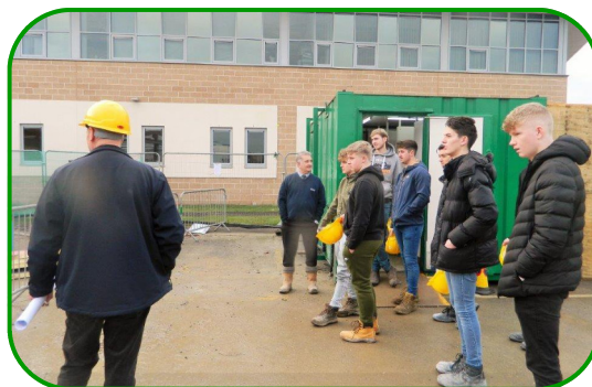
Students at Selby College site visit