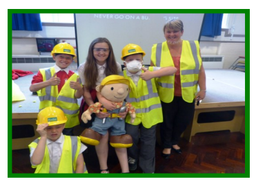
Mersey Street Primary School