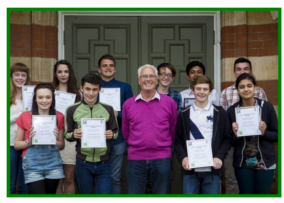
Leadership for Life Award Scheme 2014 Main Sponsor