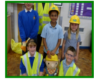
Clifton Primary School