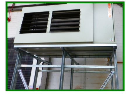
New Workshop Boiler