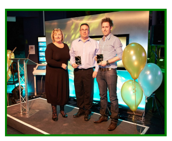
Trinity Best Refurbishment Award