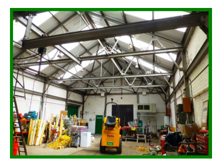
New Workshop Roof