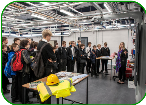
School Careers Event

Following completion of the East Riding College's new £14m Beverley campus, Houlton were invited to support a careers event organised by the college but aimed at local students from Beverley Grammar School, Beverley High School and Longcroft School. We spent the day speaking to pupils about the opportunities within construction and the options they should consider at GCSE to give them a head start. At the end of the session hand-outs were available for interested students who were considering apprenticeships or other routes into construction.