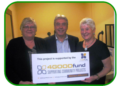
YORhub 4Good Fund Presentation

Houlton assisted with the initial feasibility and layout proposal for new disabled toilet facilities at Howden Working-Men's Club and were extremely pleased to be given the opportunity to view the finished product which was funded by a £6,000 donation from the YORhub 4Good Fund.