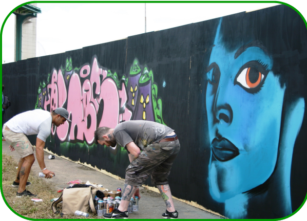
Humber Street Sesh Graffiti Artists at Work