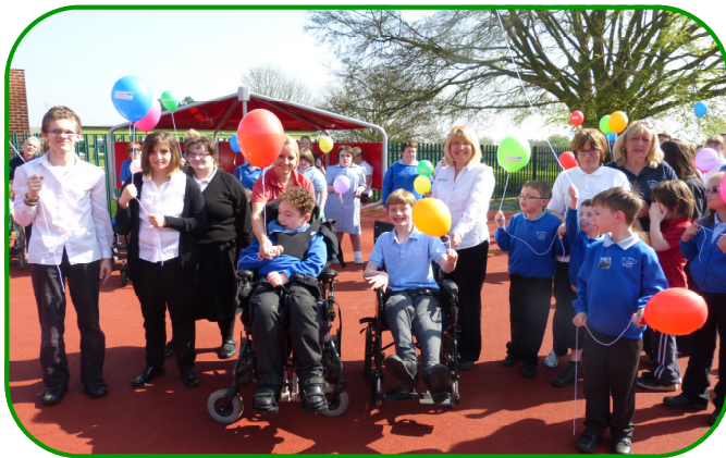
Balloon race at St Anne's School