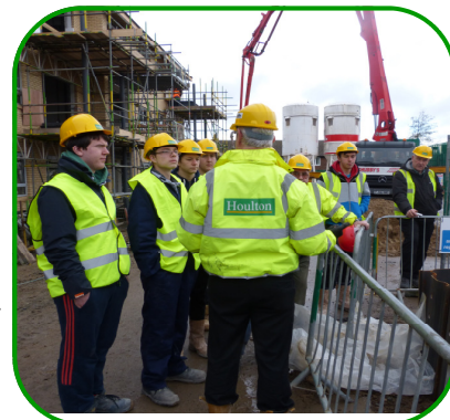
Students at Extra Care site visit