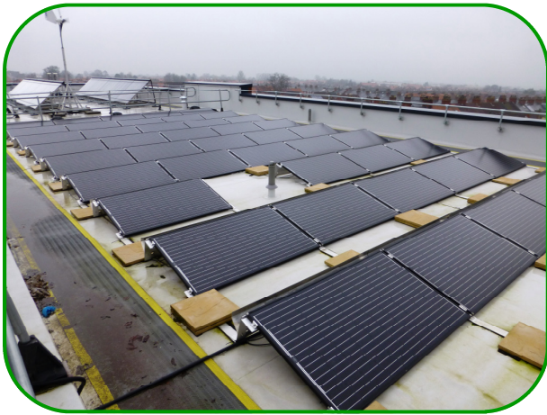
Photovoltaic and Solar Panels Installations