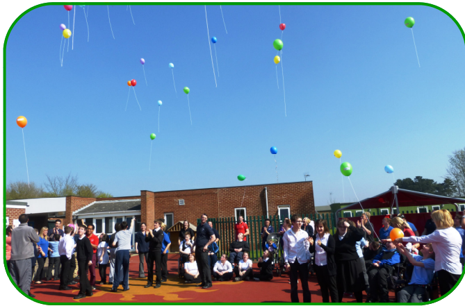
Balloon race at St Anne's School, Welton