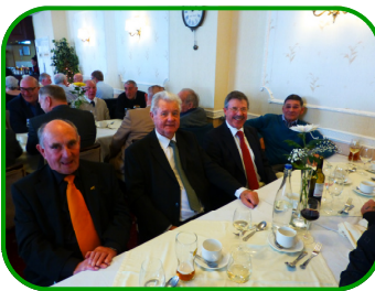
Annual pensioners and long serving employees luncheon