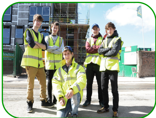
Construction Students Site Visit