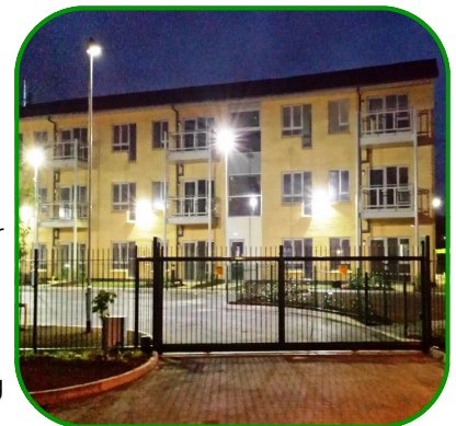
Extra Care, Beverley