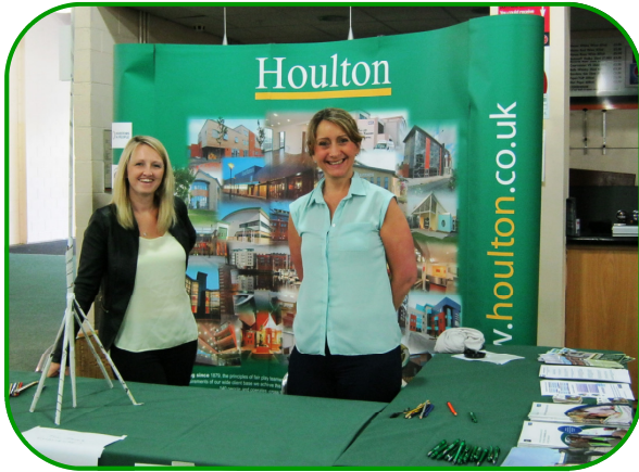
Houlton Team at the Big Bang Fair