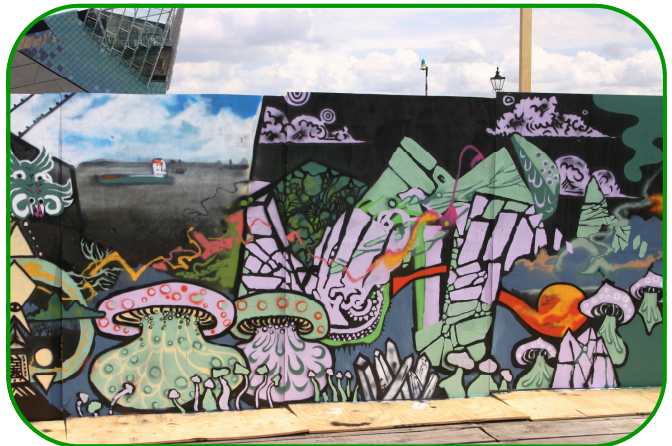
Humber Street Sesh Graffiti Artists Work