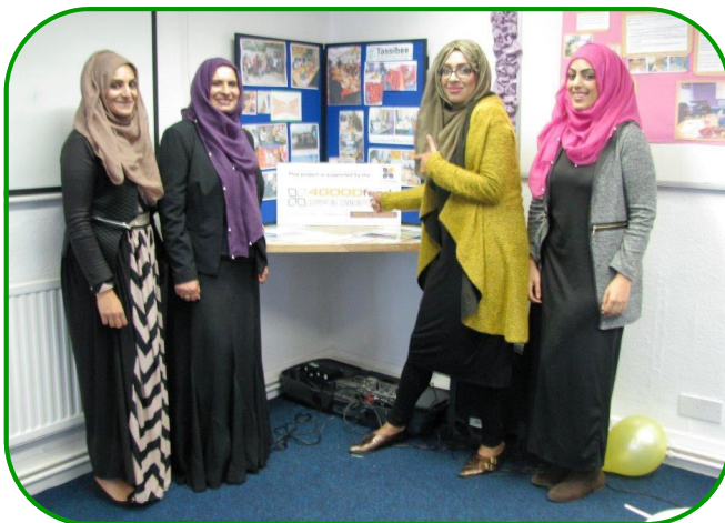
Tassibee Charity Rotherham