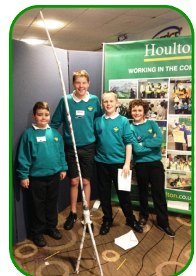
STEM in Action Event

Houlton once again attended the fantastic 'STEM In Action Event' organised by HETA. The aim being to introduce pupils to the variety of careers and skills within the different industry sectors whilst highlighting just how diverse and exciting Science, Technology, Engineering and Mathematics really is. Attended by a wide variety of companies in different industry sectors along with over 30 primary schools from across the region. Over the two days Houlton worked with around 220 pupils and our interactive sessions comprised of our infamous 'Tower Challenge'.