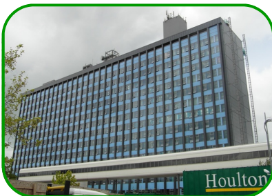
HRI Tower Block