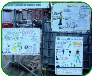
School Site Safety Posters