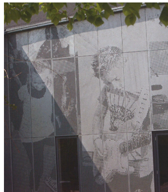
Sue Middlehurst Principal

The current Art and Design building on Westwood Ho will change its focus to animal care studies, even incorporating a cattery.