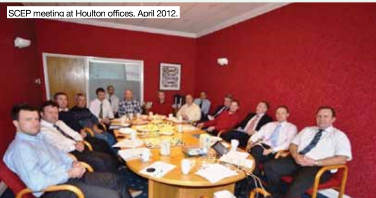
SCEP meeting at Houlton offices. April 2012.

As leading players on the YORbuild Framework we are now involved in two major areas of development that align with the regeneration impact that YORbuild seeks to deliver.