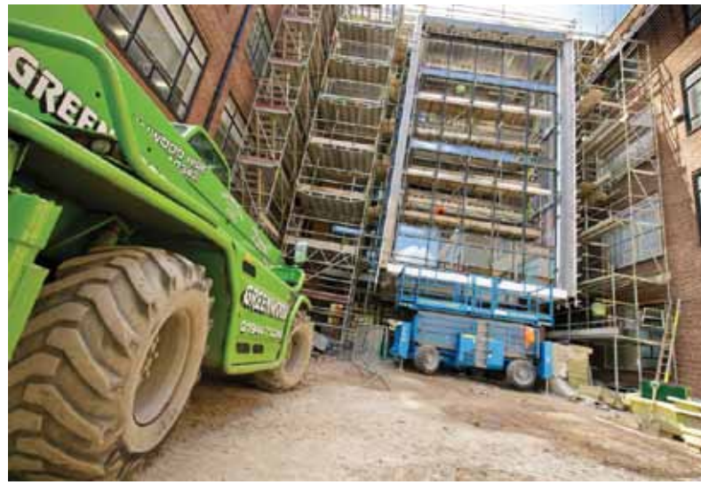
Hull University Allam Building

Once completed, the Allam Building will bring academics from the Chemistry and Biology departments together with colleagues from the Postgraduate Medical Institute and the Hull York Medical School, significantly strengthening the University's Interdisciplinary Clinical Biosciences Institute.