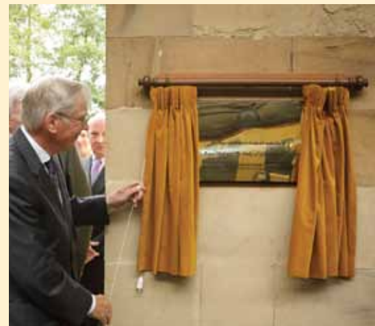
HRH the Duke of Gloucester.

The Duke arrived on the footplate of the GWR 7800 Foxcote Manor steam train into Pickering Station before touring the newly built Reussner Learning Centre and the recently completed and now award-winning visitor centre, before unveiling a ceremonial plaque to commemorate the completion of the station's renovations.