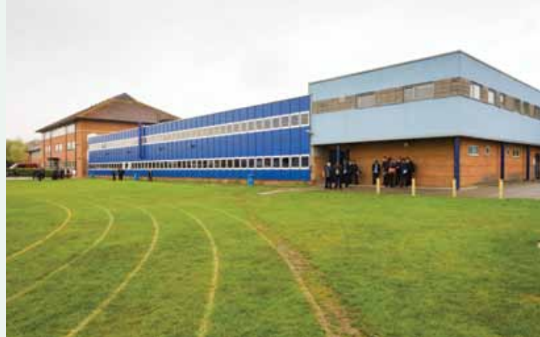
Canon Lee School York

Despite this, we were able to ensure that disruption to school lessons was minimised through weekly coordination meetings with the school's Site Manager and the works were completed ahead of target in 16 weeks.